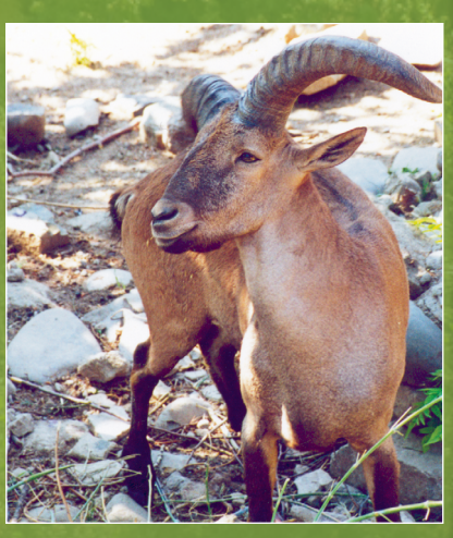
For adventure like this, join us for the best moments of your life...

Due to its large areas of uninhabited forest and remote high alpine zones. Georgia has more species of animals, than any country in Europe. This includes a number of endemic species - perhaps the most notable being the Caucasian aurochs ('jikhvi' in Georgian). unique for its splendid laterally curved horns. Besides this, Georgia has many animals now no longer found in western European countries. It has brown bear, lynx, wild boar, bezoar goats, chamois, wolves, jackal, wild cats, a number of endemic butterflies, lizards, snakes and numerous tortoises. Recently the endangered Anatolian Leopard has been caught on remote cameras in the Vashlovani National park - although it has yet to be seen by the naked eye.